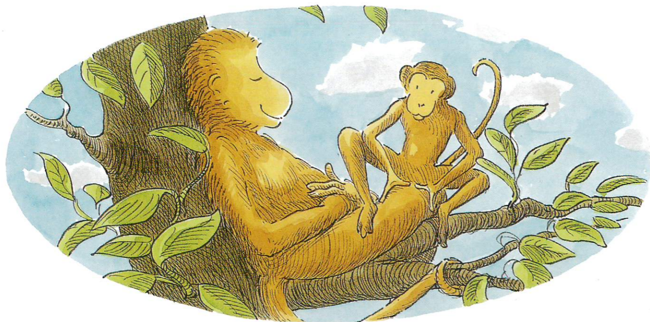
Baby Monkey wakes up.