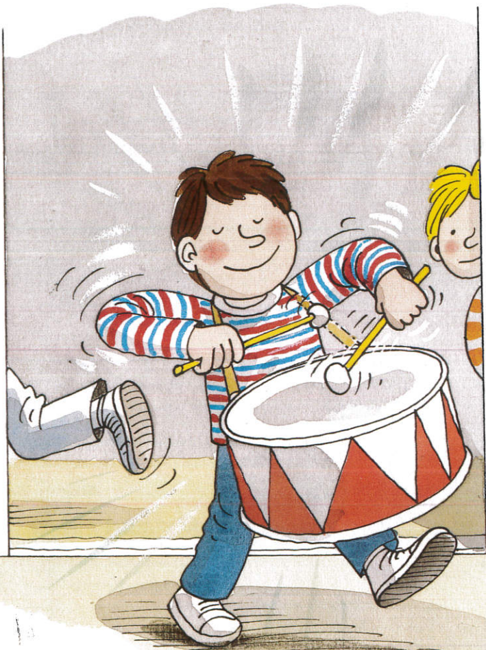
Chip had a drum.