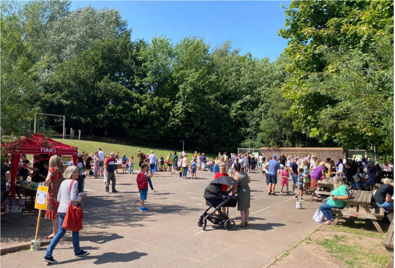
The wonderful school community gather at the Summer Fayre