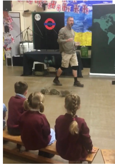
A&S Animal Encounters surprising the children at the end of the year